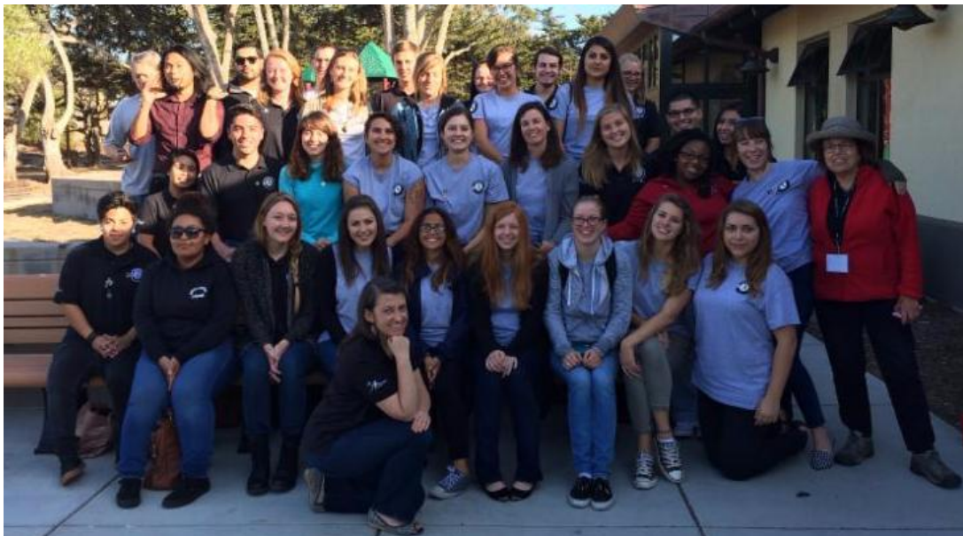
Central Regional Training