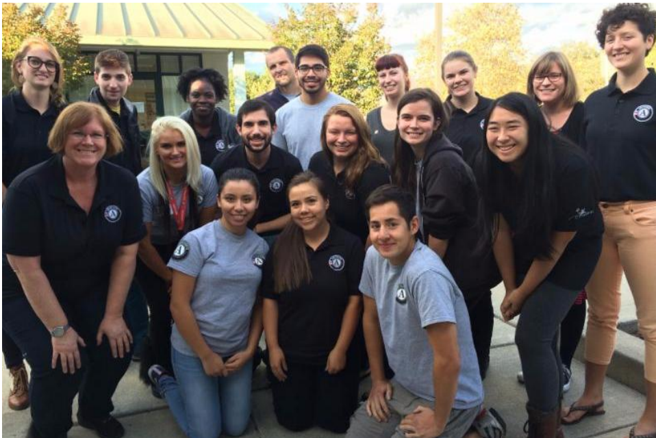
Northern Regional Training