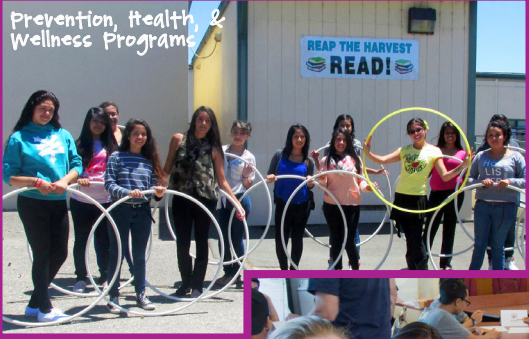
Prevention, Health, & Wellness Programs